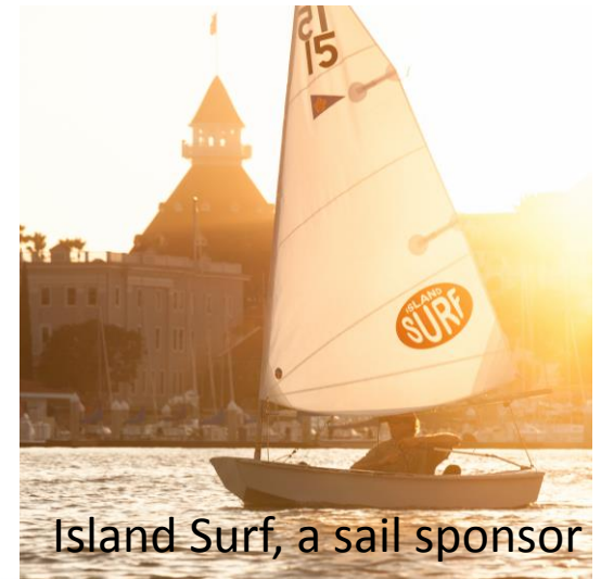
Island Surf, a sail sponsor